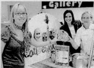
• Moores & Silver Sands involved in BBC News campaign (August 09)